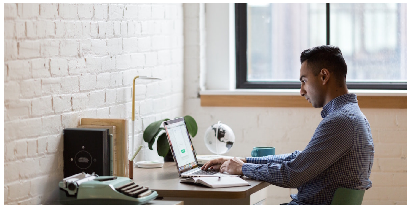
Getting ready for Christmas. I think it's time to start shopping then!

When a big company announces it wants to build a giant plant or headquarters in town, there's always ... But the retailer giant isn't the only one getting blowback.. HomeBlogAmazon isn't the only tech company getting tax breaks - TechCrunch. Amazon isn't the only tech company getting tax breaks - TechCrunch.. Company's $162 million federal tax bill — on $13.3 billion in U.S. profits ... Amazon paid a tax rate of just 1.2% last year, versus 14% for ... Amazon isn't alone, of course. ... Rules for claiming dependents on your taxes · Married with taxes: ... Amazon also said that it paid $2.4 billion in other federal taxes, ... ZARPAZO AZULGRANA EN ALMAZORA QUE LOS ELEVA AL LIDERATO: BRAVO DEPOR!